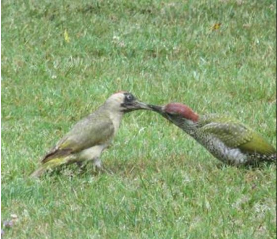
Green Woodpecker with youngster